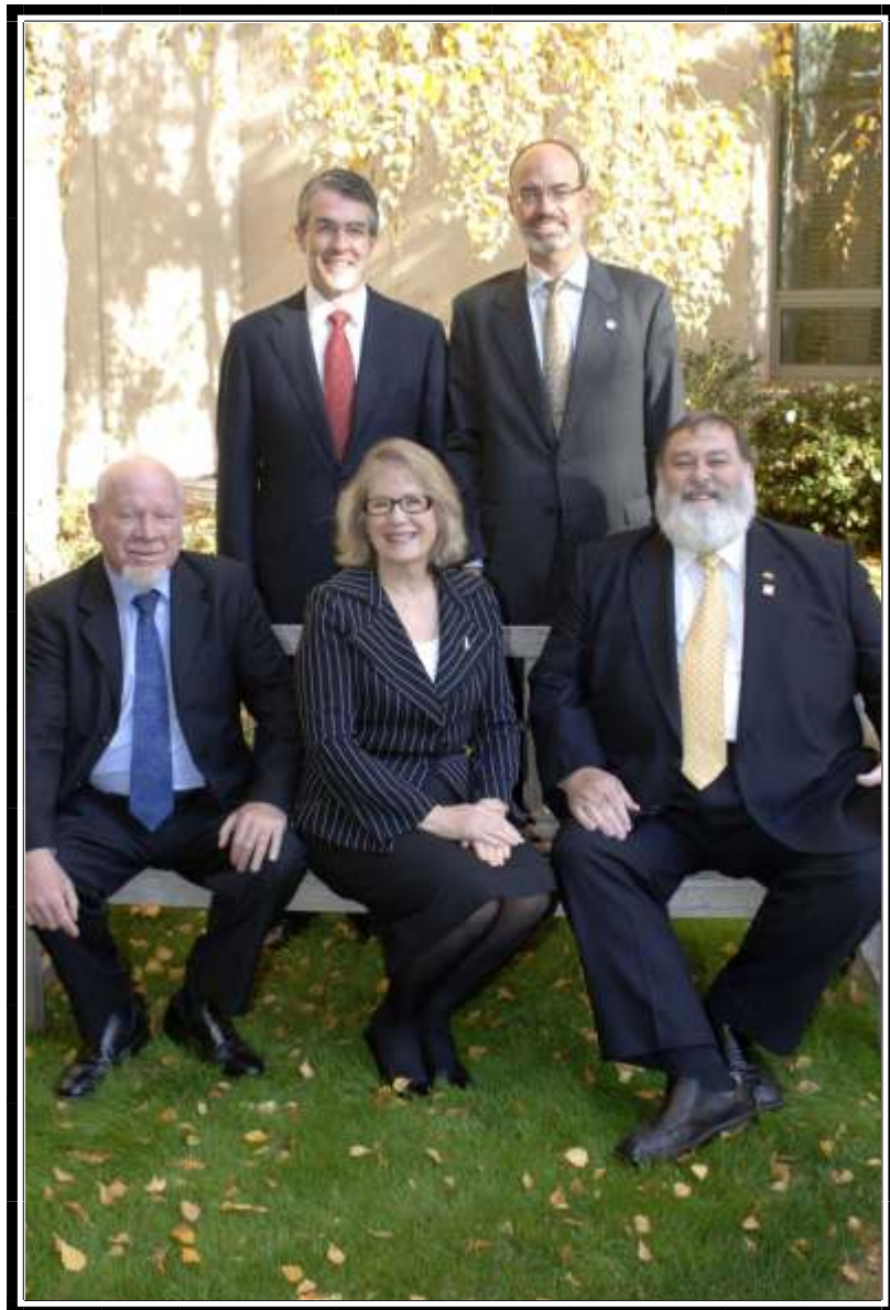
Executive members of the Parliamentary Diabetes Support Group (Back): Mr Mark Dreyfus QC MP, Senator Guy Barnett, (Front): Dr Mal Washer MP, Chair The Hon Judi Moylan MP and Hon Dick Adams MP