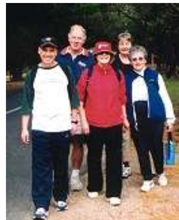
Member for Flinders, Hon Greg Hunt MP, completed his first diabetes fundraising awareness walk in 2004 and his second in 2007