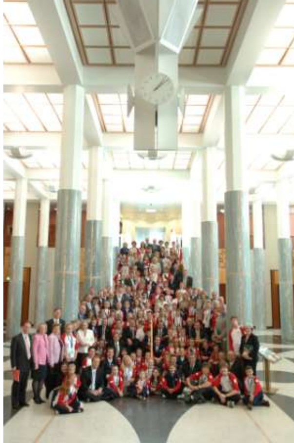
Above: Kids in the House 2006 participants gather inside Parliament House..