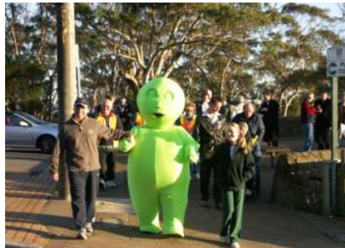
Flinders MP Greg Hunt's begins his 500km sponsored walk around the Flinders electorate that raised just over $55,000 for the Juvenile Diabetes Research Foundation