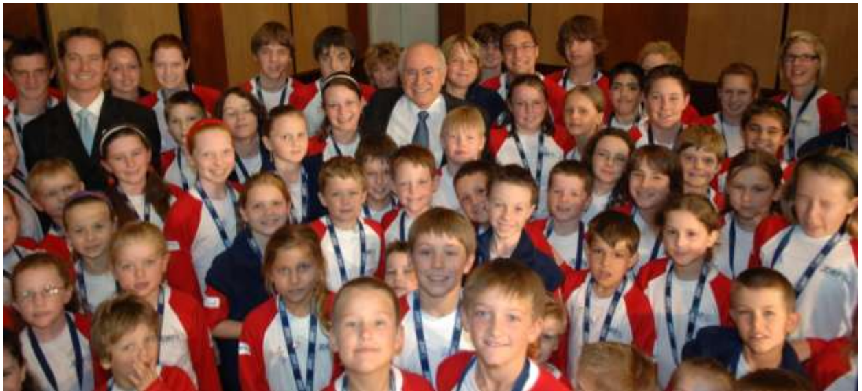
In 2006 the Kids in the House were able to meet with former Prime Minister the Hon John Howard.