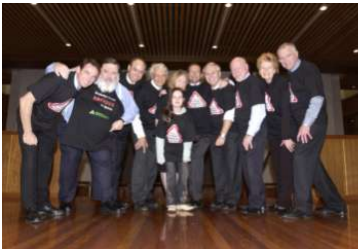
Executive Members of the PDSG and industry experts at a Diabetes awareness function at Parliament House.