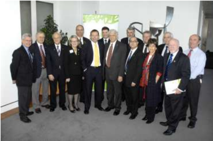
The participants of the Futures Forum that was held in Canberra in August 2007.