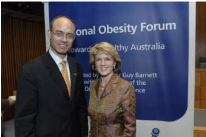
Above: Senator Guy Barnett with then Minister for Education Science and Training, Hon Julie Bishop MP, at the National Obesity Forum.