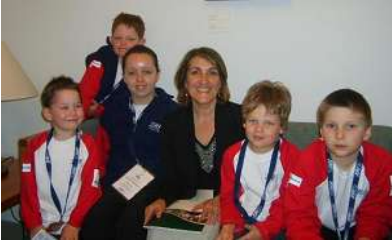
Below: Member for Calwell, Ms Maria Vamvakinou MP, with young people at her Parliament House office