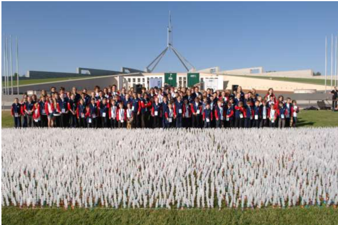
Above: Kids in the House participants in 2006 on the demonstration lawn at Parliament House with the 1000s of syringes placed there to tell a story .

For further information or copies of the report please contact one of the PDSG Executive members -