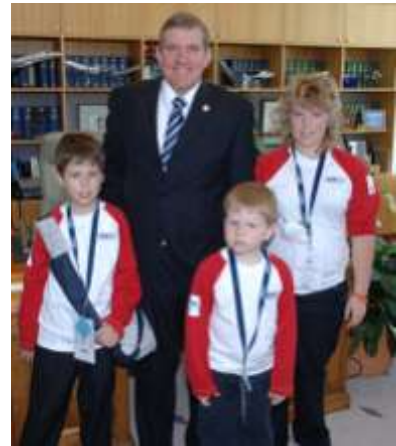
Former Minister for Industry, Tourism and Resources, Hon Ian MacFarlane MP, with Kids in the House guests