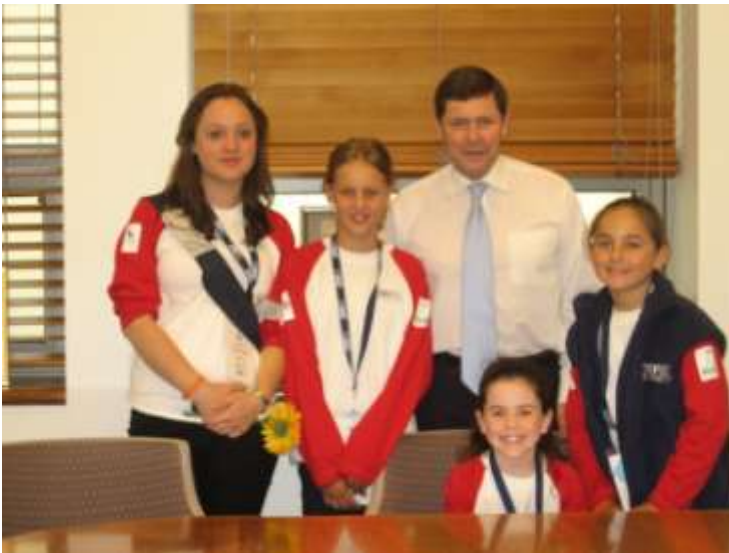
Former Minister for Immigration and Citizenship, Hon Kevin Andrews MP, with a group of young people during the Kids in the House Event.