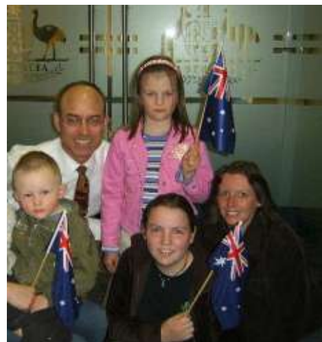
Executive member of the PDSG Senator Guy Barnett "flies the flag" for diabetes.