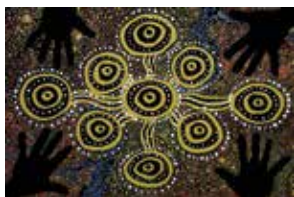
"Hands on Country"