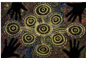
"Hands on Country"

Blood vessels in the macula, the central area of the retina, can leak, causing swelling. This can result in central vision loss.