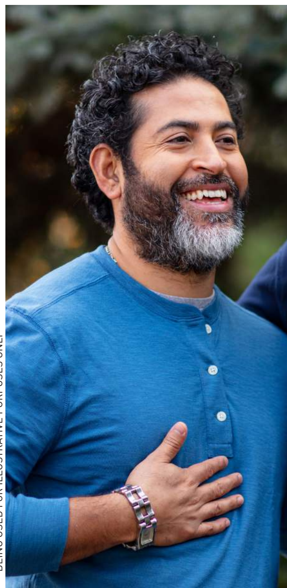
THE PERSONS DEPICTED IN THIS POSTER ARE MODELS AND THE IMAGES ARE BEING USED FOR ILLUSTRATIVE PURPOSES ONLY

The study will test if the investigational medicine (a medicine being studied) may help reduce the risk of heart disease and kidney disease in people with excess weight.